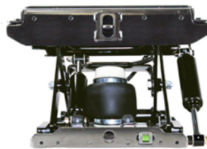
Double Damper View